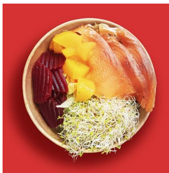
Keep The Beet